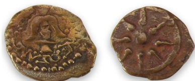
Figure 1: Authentic Widow's Mite coin